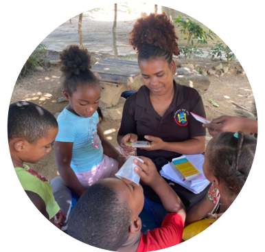
Breaking Barriers & Youth Care Center