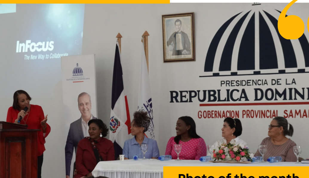
Photo of the month