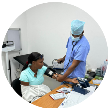
Medicine & Healthcare